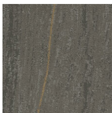
Cornerstone Copper 33555